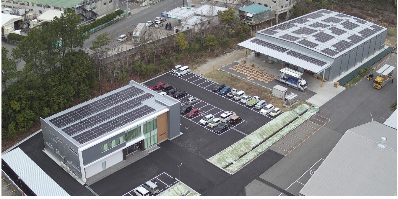
(The buildings where TERASEL Solar has been introduced)

[Headquarters of ONOMICHI KUMIKA INDUSTRY CO., LTD.]